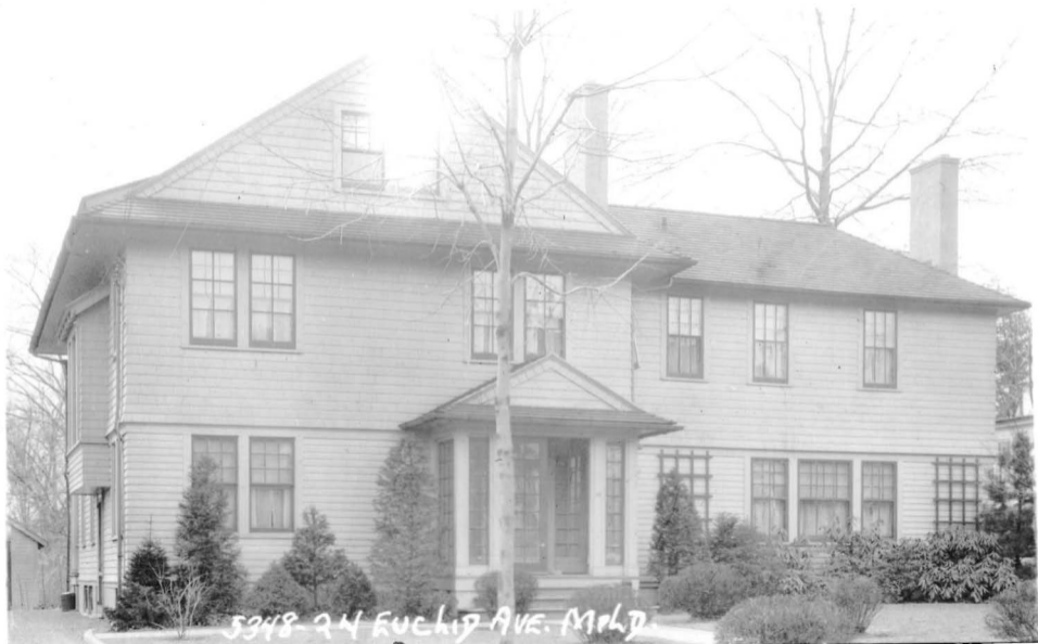
5348 24 Euclid Ave. Mpls. BOARD OF REALTORS of the ORANGES & MAPLEWOOD